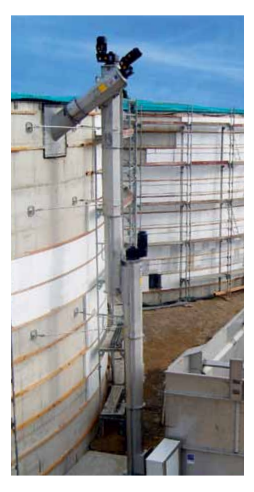
Conveyor screw technology model 450 Designed as a double steep screw for filling fermenters up to 20 m high.

Interesting solution for extensions and repowering.