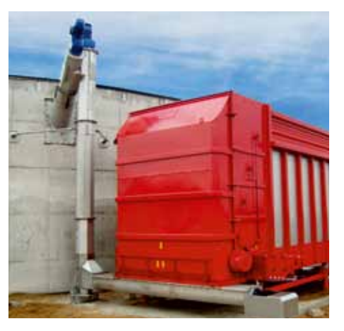
Conveyor section model 360 with double base frame screw Our screw systems can be connected to a wide variety of dosing containers.