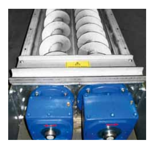
Double base frame screw model 360 for taking in material from the push floor systems etc.