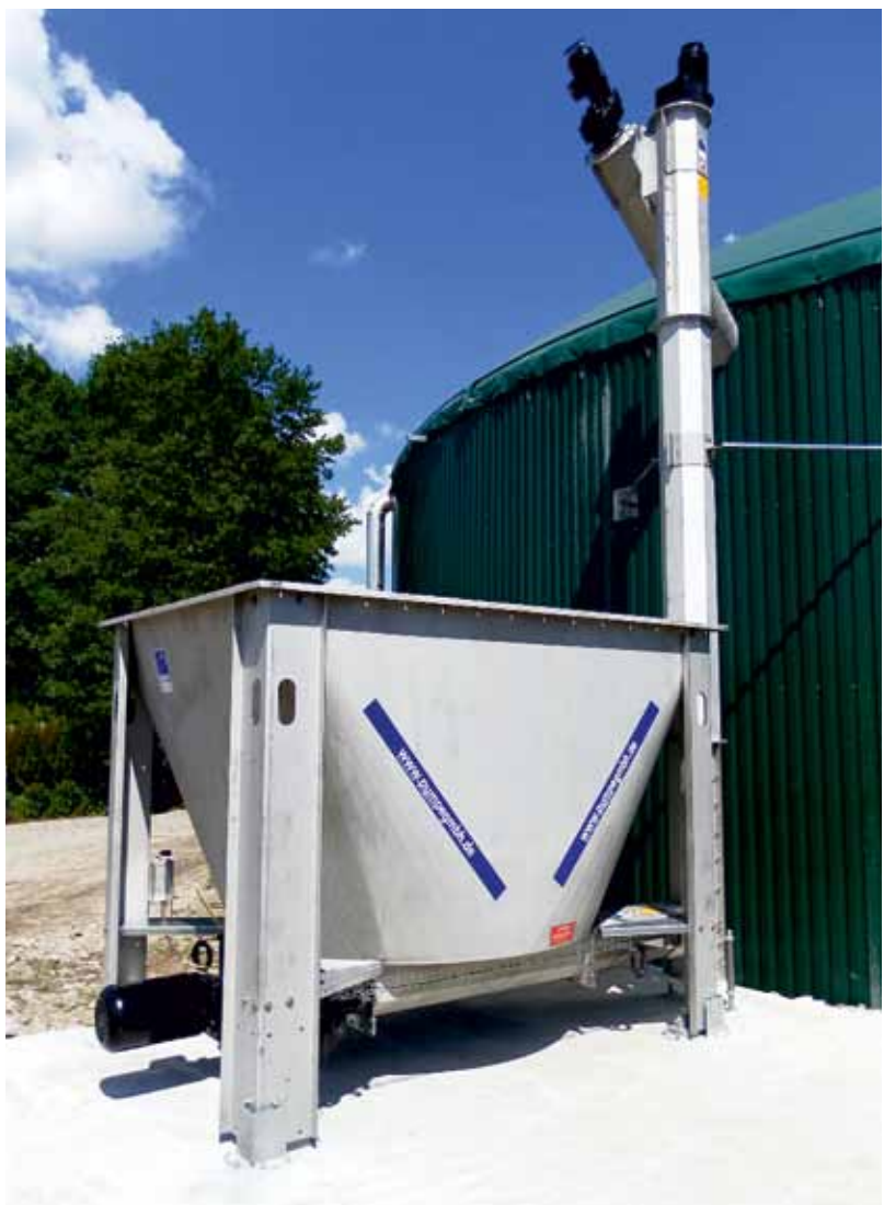
KOMBI-Mix 8000-8 m³ with screw technology model 360K

The systems stand out due to their excellent price/performance ratio and are thus particularly well suited for biogas plants with a power range of 75 kW. The KOMBI-Mix dosing unit is designed for feeding biogas plants which require up to 10 m³ a day.