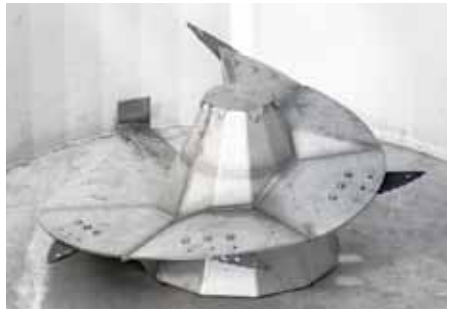
Dosing and mixing screws