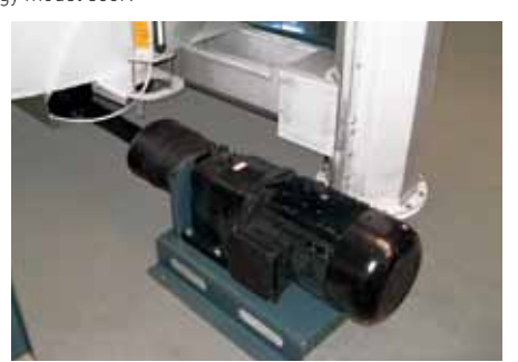
Driven via motor, drive shaft and planetary bevel gear to blade or mixing screw