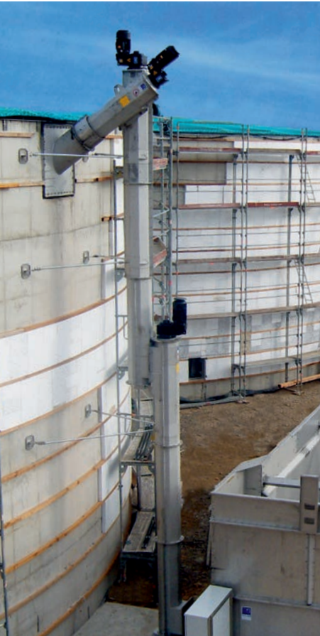
Conveyor screw technology model 450 Designed as a double steep screw for filling fermenters up to 20 m high.