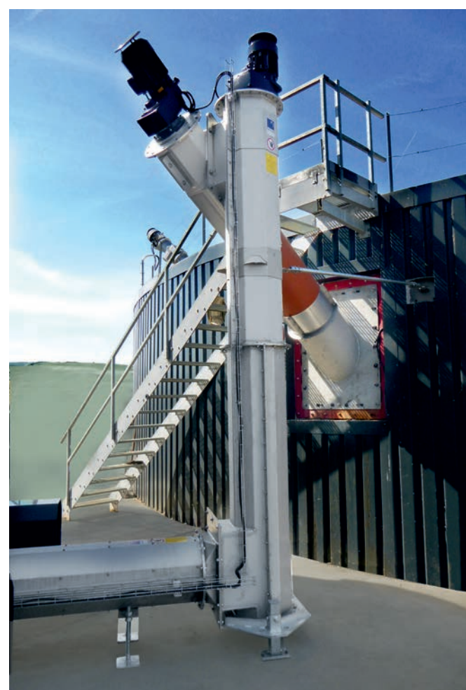
3-piece conveyor screw section model 450 consisting of base frame screw, steep conveyor screw and fermenter screw

We offer conveyor screws in various designs and at various conveyance capacities, with which we can meet the most diverse requirements with regard to feed rate and substrate composition. The screws can be manufactured in various grades of steel and stainless steel. Our horizontal and inclined conveyor screws are designed as feeder screws, which are lined with wear-resistant plastic. The particular shape of the vertical screw's outer tube inhibits the movement of the substrate in the screw and thus ensures the continuous conveyance of even the most difficult materials. The advantage of vertical conveyance is that the screw shaft is centered in the feed substrate and doesn't come into contact with the outer casing. The screw drives are durable and robust offset geared motors, designed for the hazardous area according to the applicable ATEX guidelines. With the easy installation system technology, the pre-assembled screw system can be installed and ready for operation within a few hours.