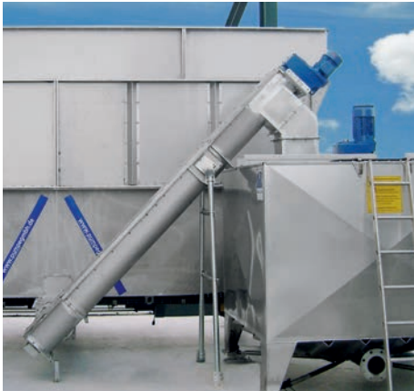
Base frame screw and inclined conveyor screw model 360 for feeding a mixing container Our conveyor screws can be applied in diverse areas, including fully automatic feeding systems for cows and pigs and in the recycling industry.