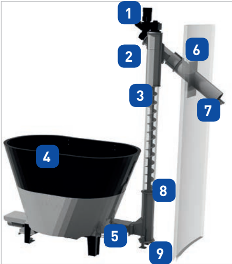
Screw section model 360/450 1 Steep conveyor screw and fermenter screw drives according to ATEX 2 The fermenter screw is attached to the steep screw 3 Stainless steel steep conveyor screw design according to ATEX conveyor height up to 20 m 4 Solid matter dosing unit in different designs 5 Stainless steel base frame screw. In-feed and dosing screw for blade lengths, according to model, up to 130 mm 6 Wall duct standard 35° The component is responsible for the liquid and gas seal 7 Fermenter screw V2A and V4A Design according to ATEX. Various feed through systems 8 Swivel flange Mounting can be adjusted 9 Screw base for supporting the weight of steep and fermenter screws on the foundation