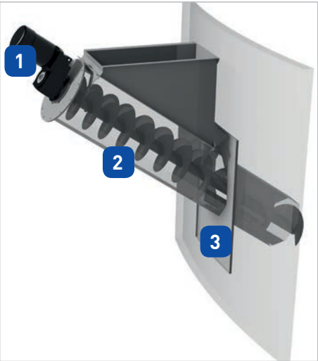
Fermenter screw model 600 side input 1 Screw and drive according to ATEX 2 All stainless steel construction 3 Mounting plate in the fermenter wall