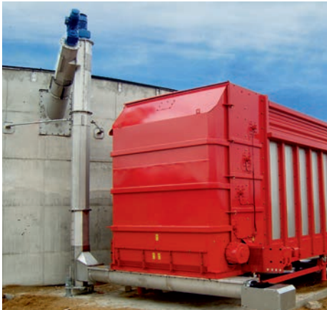
Conveyor section model 360 with double base frame screw Our screw systems can be connected to a wide variety of dosing containers.