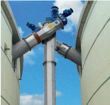
Steep conveyor screw model 360 with 2 fermentation screws for double entry for 2 containers Interesting solution for extensions and repowering.