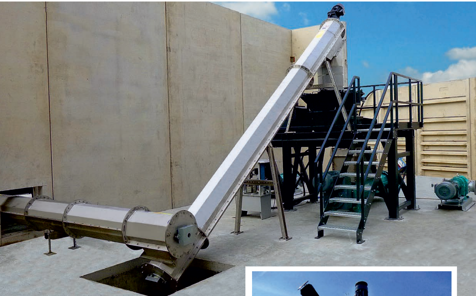
Screw section model 450 with horizontal and inclined screw conveyance to a crusher unit

We offer conveyor screws in various designs and at various conveyance capacities, with which we can meet the most diverse requirements with regard to feed rate and substrate composition. The screws can be manufactured in various grades of steel and stainless steel. Our horizontal and inclined conveyor screws are designed as feeder screws, which are lined with wear-resistant plastic. The particular shape of the vertical screw's outer tube inhibits the movement of the substrate in the screw and thus ensures the continuous conveyance of even the most difficult materials. The advantage of vertical conveyance is that the screw shaft is centered in the feed substrate and doesn't come into contact with the outer casing. The screw drives are durable and robust offset geared motors, designed for the hazardous area according to the applicable ATEX guidelines. With the easy installation system technology, the pre-assembled screw system can be installed and ready for operation within a few hours.