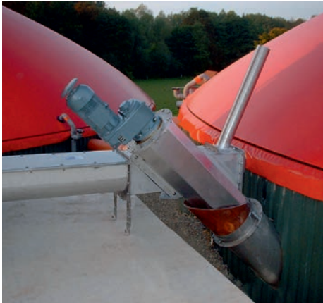
Base frame screw and fermenter screw model 360 for floor grade input We tailor our conveyor systems to a site's architectural and topographical conditions.